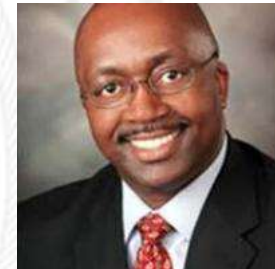
Avery Niles Commissioner, Georgia Department of Juvenile Justice